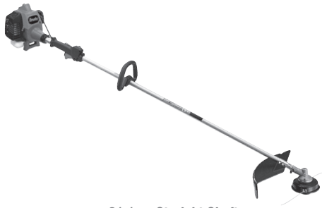
21.1 cc Straight Shaft Grass Trimmer TCG22EASSLP